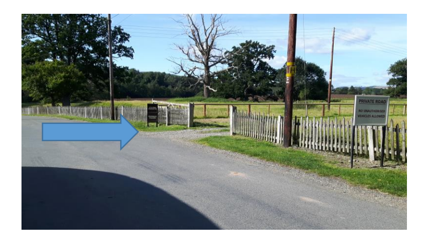
Until you come to a gateway on your right