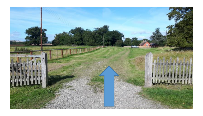
Follow this track down to the middle of the field and turn right into the car park where you will see our base