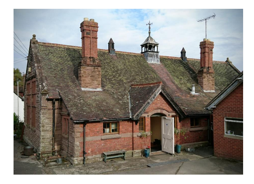
Come round to the left hand side of the building to our front door.