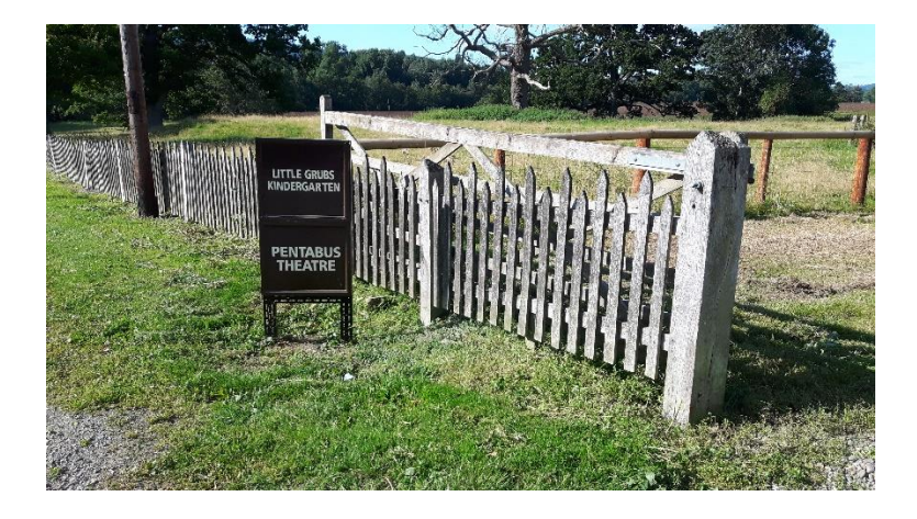
Where you will find the Pentabus sign