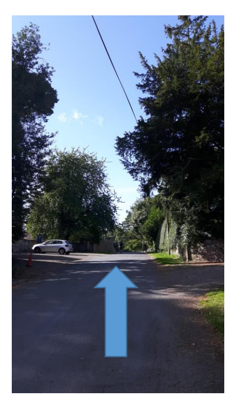
Follow the road around past the church on your left