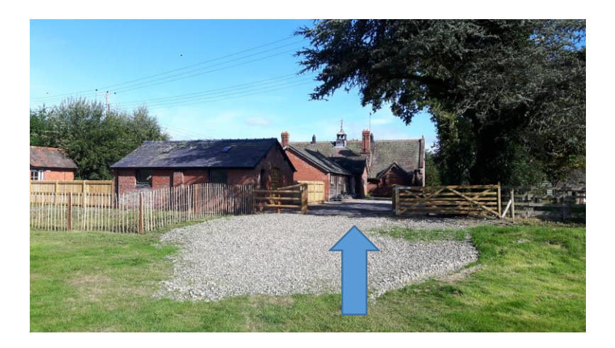
You can park in the field or our car park